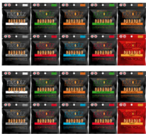
DOUBLE FLAVOR INFUSED PEANUTS SAMPLE PACK ALL FLAVORS!