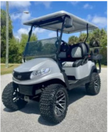
2017 SILVER LITHIUM PHOENIX $16,299