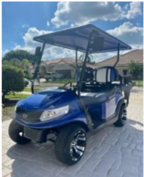
2017 CLUB CAR PRECEDENT Contact for Price