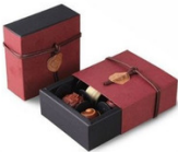
Chocolate Packaging Boxes