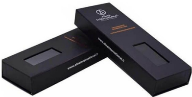
Hair Extension Boxes 191