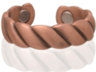
MAGNETIC PURE COPPER RING