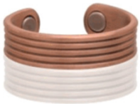
MAGNETIC PURE COPPER RING