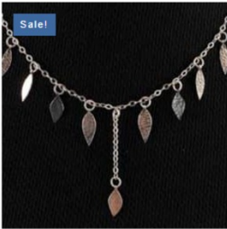
TIFFANY NECKLACE SKU: MW N470